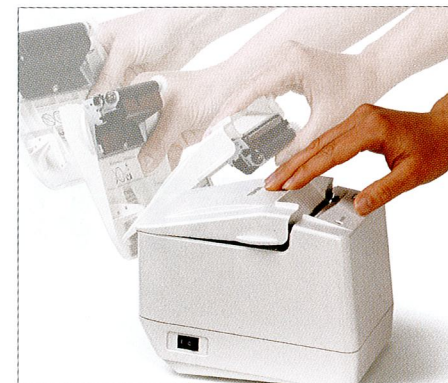
Choice of opening mechanisms

Save paper and create promotions with the TRST-A15 double-sided thermal printer