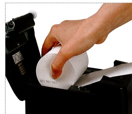
Easy drop-in paper loading