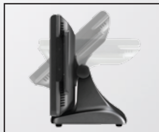
Wide Tilt Angle