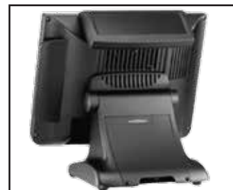
SP-820 with the 2x20 VFD (Optional)