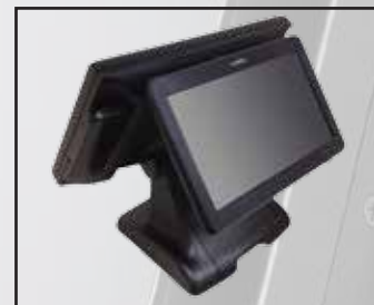
SP-820 with the 11.6" LCD (Optional)