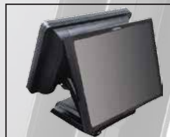
SP-820 with the 15" Bezel Free LCD (Optional)