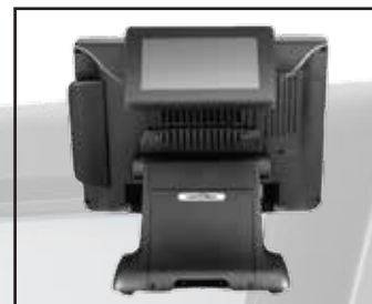
SP-820 with the 7" LCD (Optional)